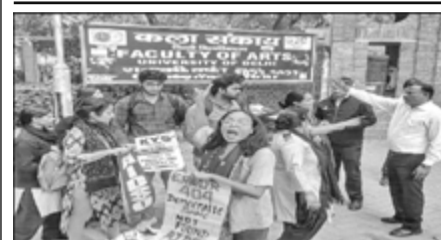
AIDSO opposed blanket ban on all forms of public meetings in DU campus. On 19 February, when the AIDS0 and other left organisations were holding press conference, they were assaulted.