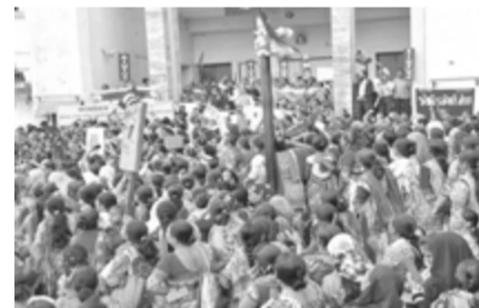
AIUTUC workers demonstrating in Surat along with other central trade unions on All India Strike Day on 12 February.

To conclude, it can only be said that education in India is in its lifetime peril. The motto of the BJP government is to annihilate education in every respect, distort its objective and transform it into a saleable