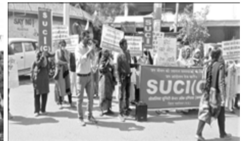
Protest in Gwalior, MP, on 17 February to press for resolution of burning problems of life