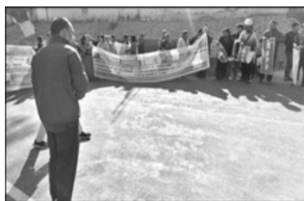
Workers of Loktak Hydro Electric Power Station (NHPC) Contract workers Union, Manipur affiliated to AIUTUC & AIPF demonstrating in support of All India General Strike on 12 February.