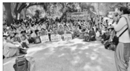
ASHA workers' protest on 12 February in Delhi for settling their long pending demands.

To defend affordable and safe rail transport, unity between railway workers and passengers is essential. The massive railway strike of 1974 demonstrated the power of organized unity. When workers and the general public get united by forming people's committees as instruments of struggle and develop a sustained movement throughout the country, it would surely pressure the government to refrain from implementing unabated privatization of Indian Railways.