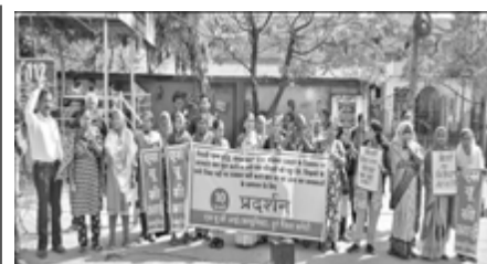
Demonstration in Durg, Chhattisgarh, on 10 February in demand for resolving basic problems people of the city are reeling under.